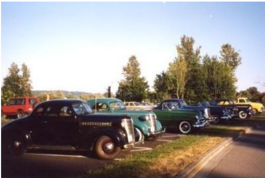
Cars at the Strawberry Social in Marymoor Park