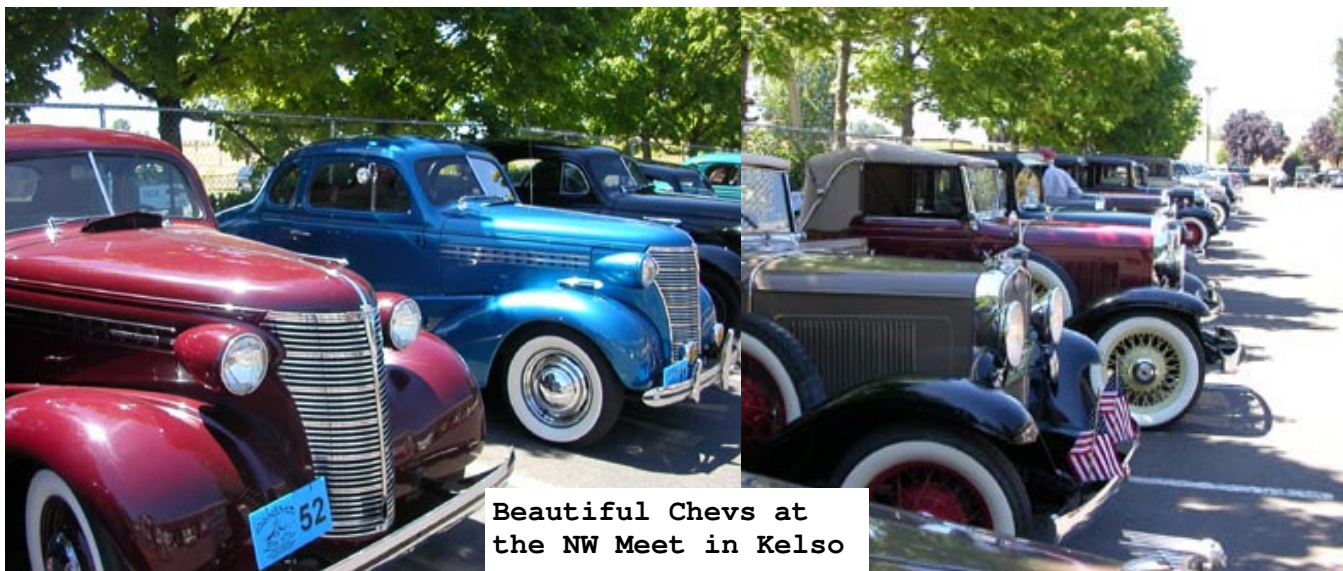
Beautiful Chevs at the NW Meet in Kelso