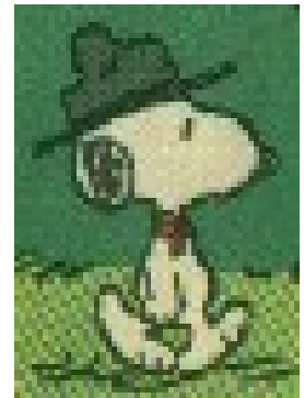
I used to be a Beagle...

Back to Gilwell, happy land I'm going to work my ticket if I can