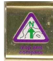
Map and Compass